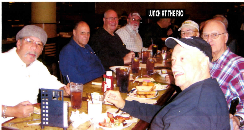
LUNCH AT THE RIO